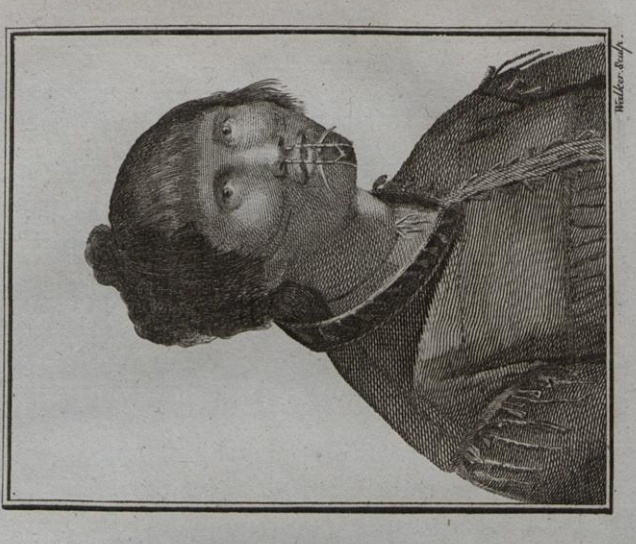
A MAN and WOMAN of ONALASHKA.